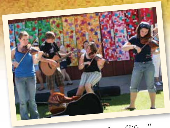
“...Sisters, a high quality of life...”