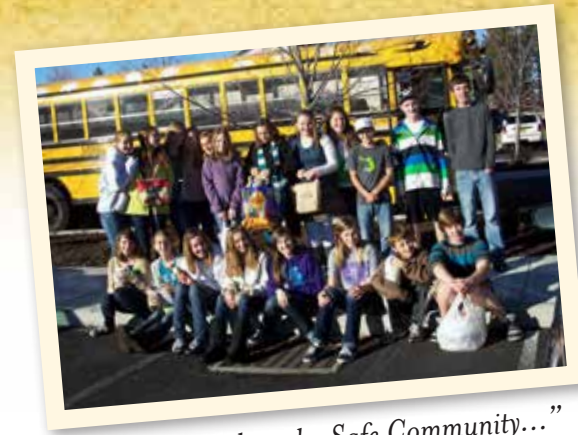
“...Safe Schools and a Safe Community...”