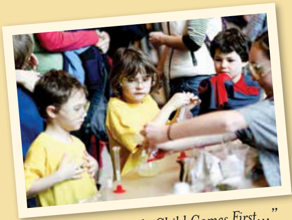
“...Where the Whole Child Comes First...”